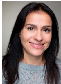
Sufia Many Ensemble